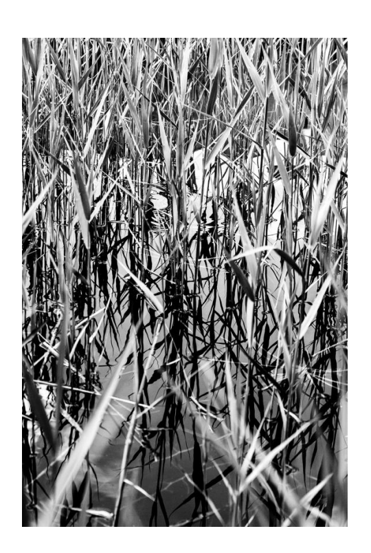
7947 Leaf, Fragment Plexus series 106 cm x 72,5cm w/frame

Fine art print Digigraphie em papel harman by hahnemulhe gloss art fibre 310gr